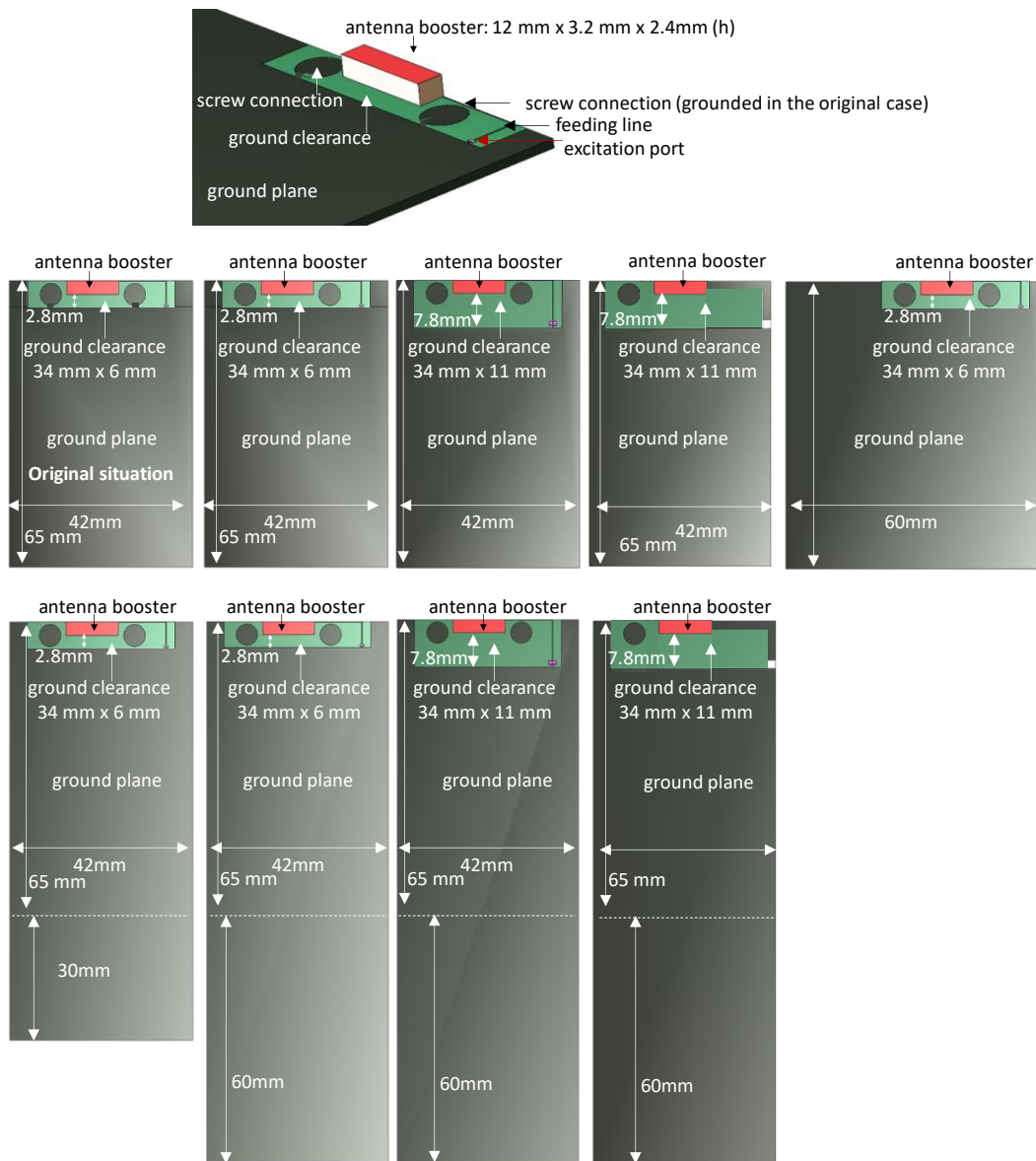
Figure 1 - Cases considered in the analysis: screw connectors, change ground clearance, change feeding location, and change PCB size. Each scenario has a matching network at the excitation port which comprises lumped elements (capacitors and inductors). Only the original case has the screw connectors connected to the ground of the PCB; at the other cases, such screw connectors are floating (non-grounded).

With these considerations, the figure is merit \Delta is then defined by eq. (1):